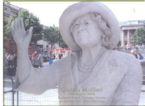
'Queen Elizabeth the Queen Mother', 2000, Trafalgar Square, London

As well as exhibiting, Aden has performed public sculpture in a total of 56 countries worldwide including Spain, Portugal, England, Italy and Australia. In Portugal his life-size "Sailor of Vilamoura" was cast in bronze and will be permanently on display in the Marina de Vilamoura. In Italy, besides exhibiting numerous busts, masks and small figures, his life-size man in clay that was exhibited for the duration of Fiera Milano.