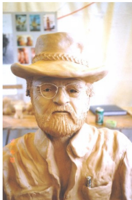
'Des Ritchie', 1999, life-size terracotta, Woodford Folk Festival, Woodford, Australia,

Early in life he discovered he had the ability to quickly sculpt clay in the imitation of life. He enjoys the uncommon act of sculpting people in public, encouraging members of the public to join in his creations.