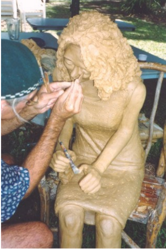
'Being Creative', life-size clay, Hyatt Regency Coolum – Creative Art Centre